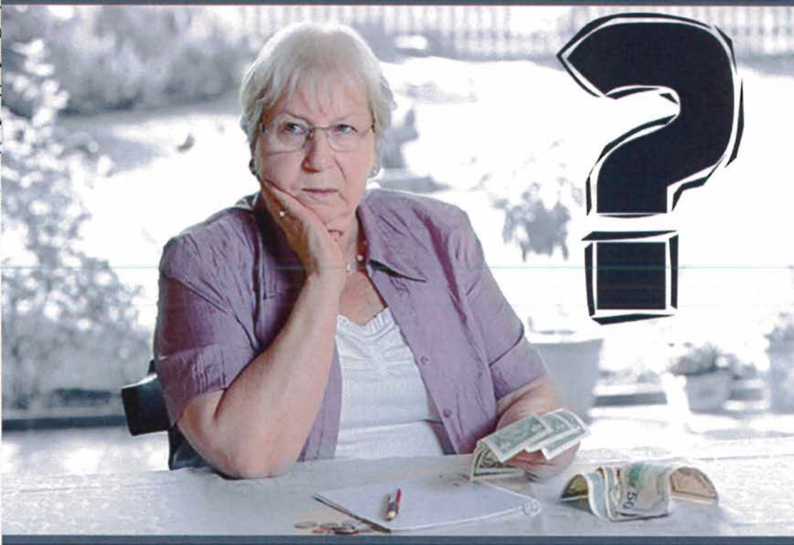
"House Republicans now embrace tab fee increase" Fox9 5/17/16 "GOP offers license tab hike" Associated Press 5/17/16